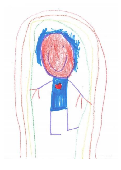
This artwork was created by a NEK-CAP, Inc. Head Start student.

Head Start services are family-centered, fostering the role of parents as the primary educators, nurturers and advocates for their children. Head Start works closely with parents to assist them in developing and utilizing individual and family strengths to successfully meet personal and family objectives. Parents are encouraged to become involved in all aspects of the program, from participation in children's activities to direct involvement in monthly Family Engagement Activities, Parent Committee and Policy Council.