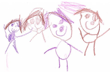
This artwork was created by a NEK-CAP, Inc. Head Start student.